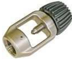
International filling connector