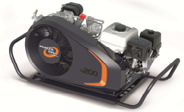
PE200-TB with handles

The optional carrying handles allow easy and comfortable transport.