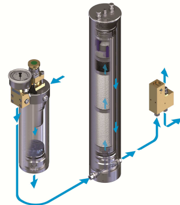
P41 purification system (picture similar)